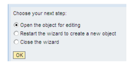
Exhibit: Object Editing

To be able to maintain the role content activate the below radio button and confirm with OK .